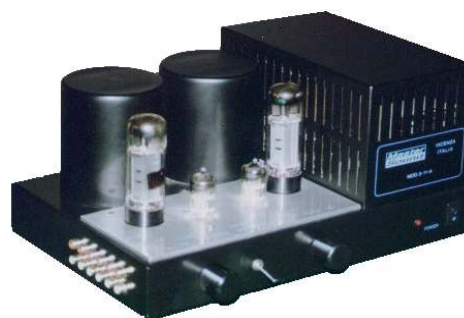
The first amplifier Mastersound (1994)